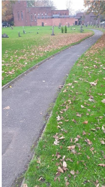
Fig 1: Tarmac pathway connecting heavily trafficked route between Crewe Crematorium and car parking area

Grit/ Limestone: Pathways comprised of a consolidated layer of finely graded natural stones offer a traditional and clearly defined aesthetic. Regular footfall helps consolidate the material to seal the path surface and suppress noxious weed growth.