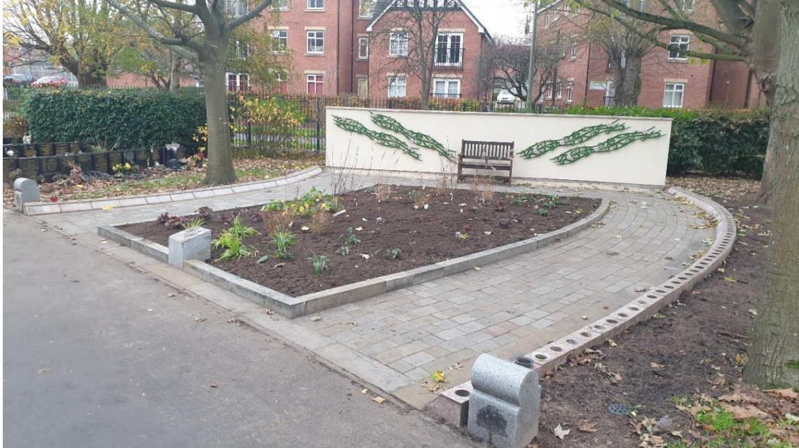
Fig 2: Paved memorialisation area at Crewe main cemetery

Mown Pathways- Grass pathways offer a naturalised appearance and are a cost-effective option to provide access for less frequently utilised areas of site. These path types require regular mowing and have the potential to become muddy and slippery in wet conditions.